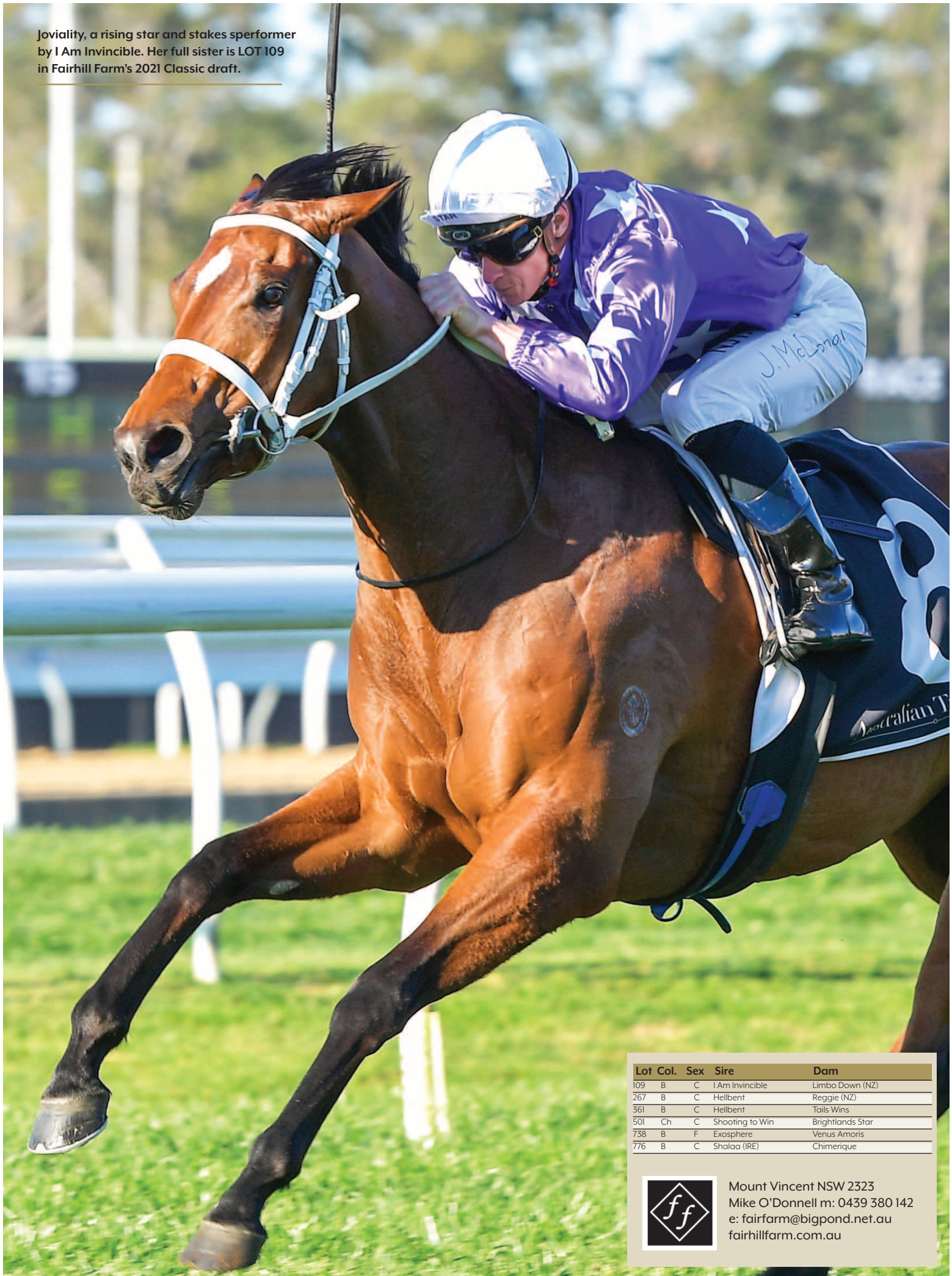
Joviality, a rising star and stakes performer by I Am Invincible. Her full sister is LOT 109 in Fairhill Farm's 2021 Classic draft.